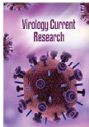
Virology: Current Research