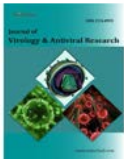
Journal of Virology & Antiviral Research